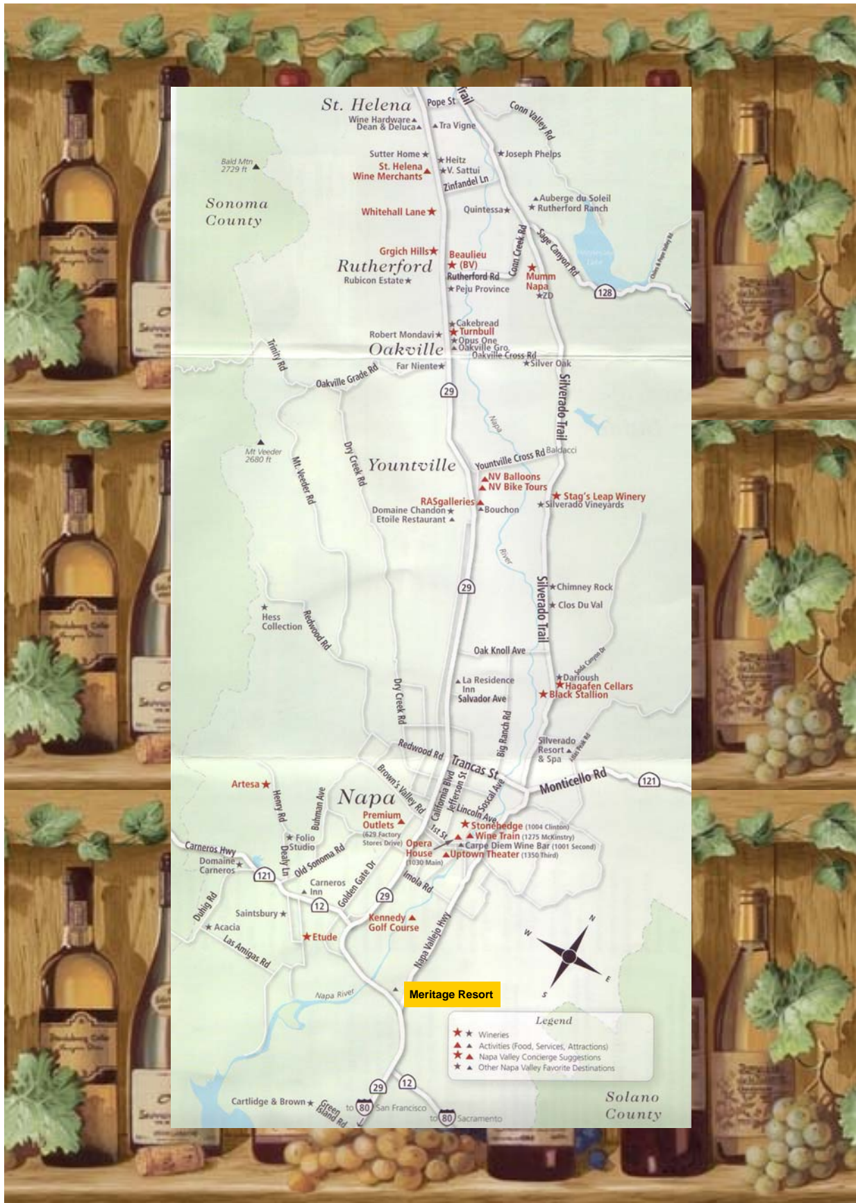
Arrive via Interstate 80 from either San Francisco or Sacramento