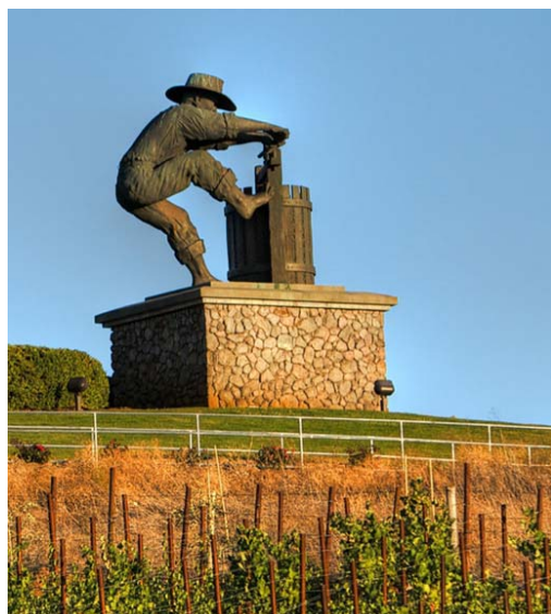
“Grapecrusher” bronze overlooking MERITAGE RESORT CAOG 88th Annual Meeting Oct. 6 – 9, 2021

Please remember to promptly notify the CAOG office of any member deaths. All names will appear in the Annual Meeting program book and will be read at the Annual Business Meeting.