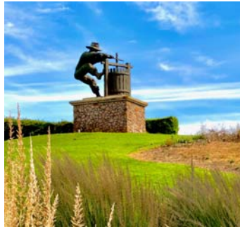
California Wine Country during Harvest & Crush