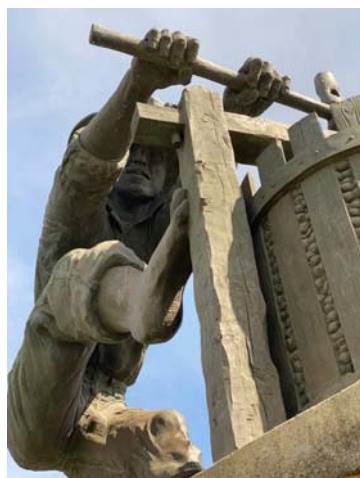
Napa Grape Crusher

Any ideas for collaborative investigation are urgently requested and all inquiries are welcomed !!