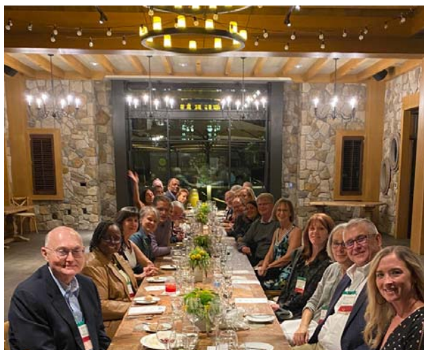
Annual Past Presidents and Board of Directors Dinner was a huge success as always