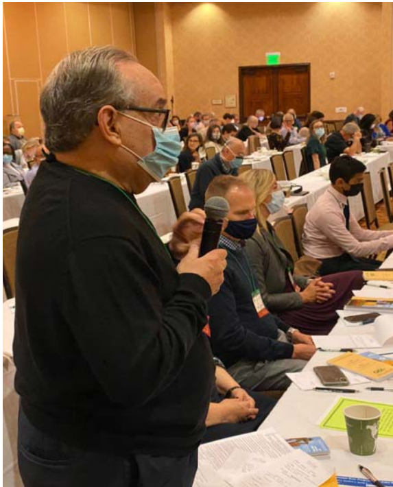
Masking in the time of Covid-19 CAOG 2021 – Napa, California