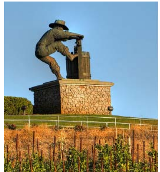
“Grape Crusher” at Meritage Resort

The Meritage Resort keeps doubling its size, and is equally accessible from airports in both San Francisco and Sacramento. Most attendees will want a rental car not only for the 2 hour