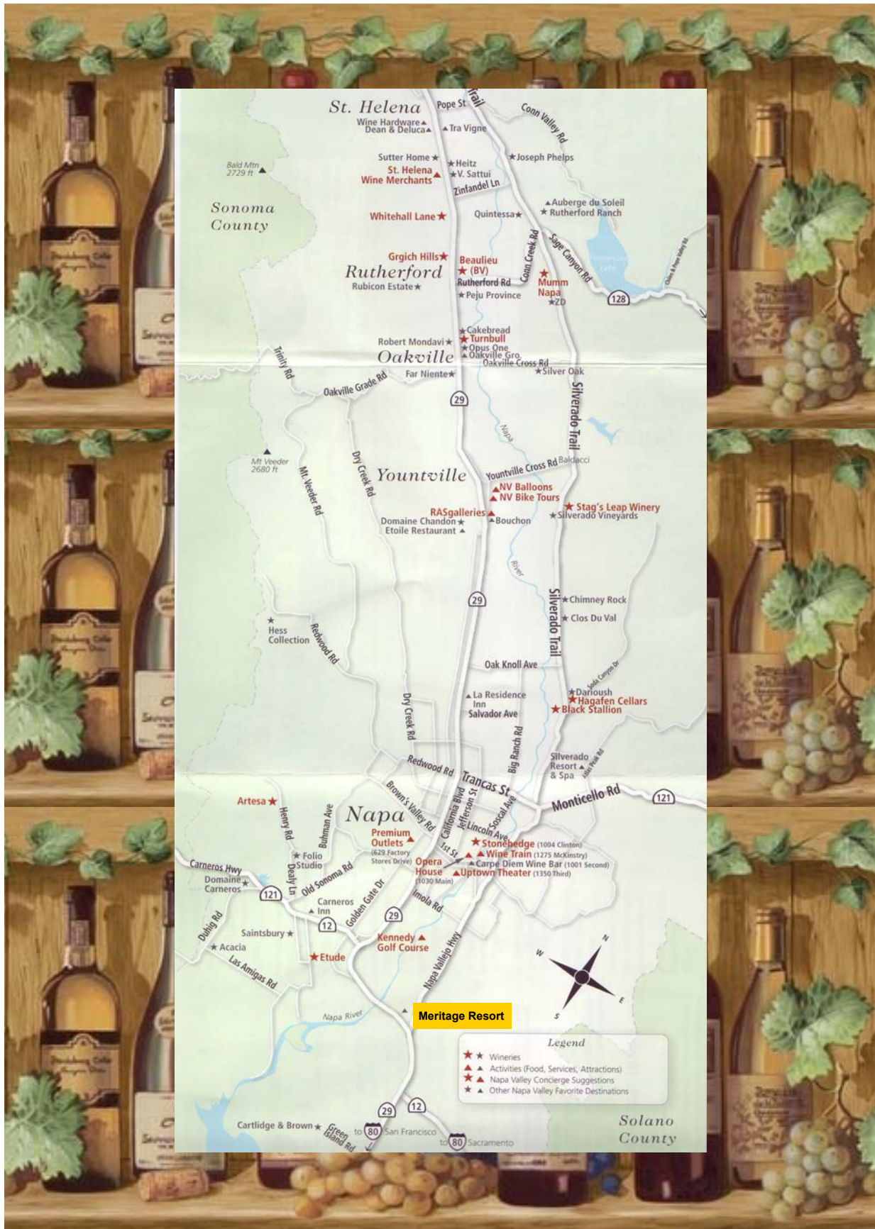
Arrive via Interstate 80 from either San Francisco or Sacramento