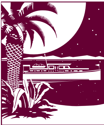
Save money too!

Time is running out to process 2009 new member applications.