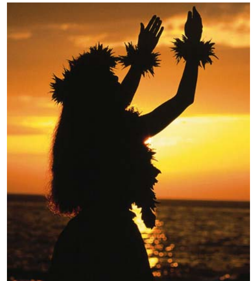
HAWAII: Escape to Paradise

We expect a sold out meeting since District VI ACOG is using this for their annual meeting as well. Reserve your rooms as soon as possible. Registrations are running well ahead of previous years.