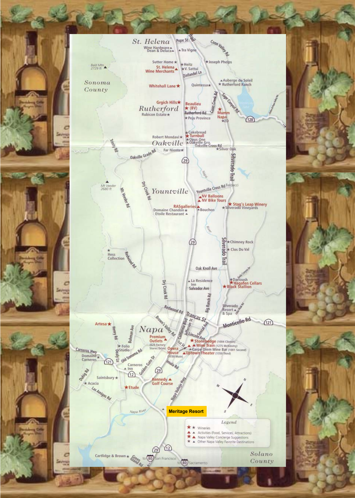
Arrive via Interstate 80 from either San Francisco or Sacramento