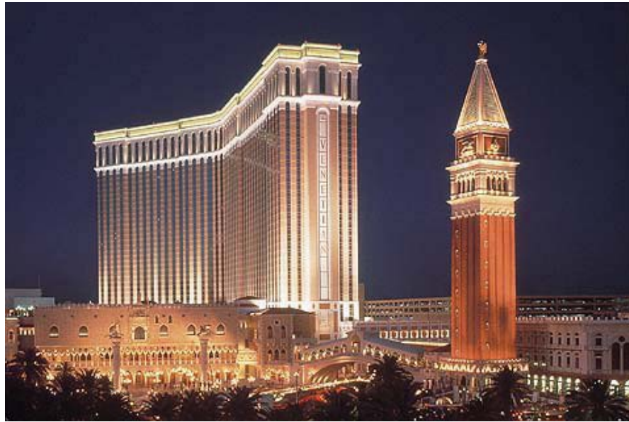
“Enjoy the spectacular Venetian Resort, Hotel and Casino”